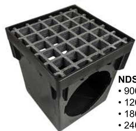
NDS Catch Basins • 900 Series • 1200 Series • 1800 Series • 2400 Series