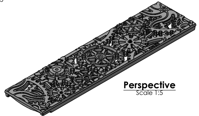
Perspective Scale 1:5