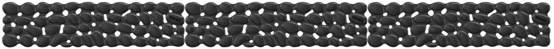
3 GRATES ARRAYED SCALE 1 : 6