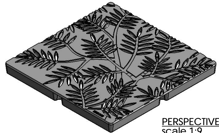
PERSPECTIVE scale 1:9